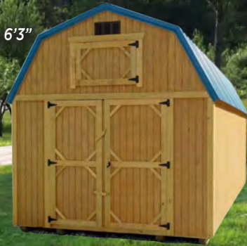
Standard Wall Height 6'3"