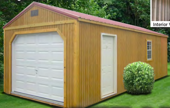
Standard Wall Height 7'8"