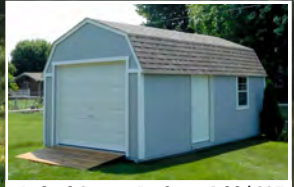
Lofted Garage Package Add $695