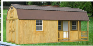
Side Lofted Cabin