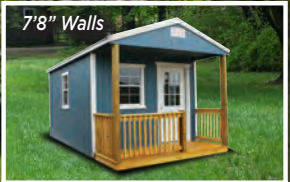
Cabin Package Add $595