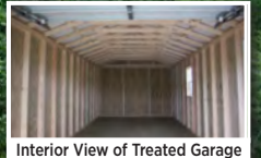
Interior View of Treated Garage