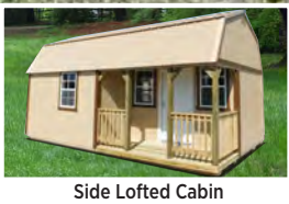
Side Lofted Cabin