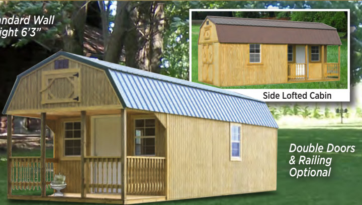
Standard Wall Height 6'3"