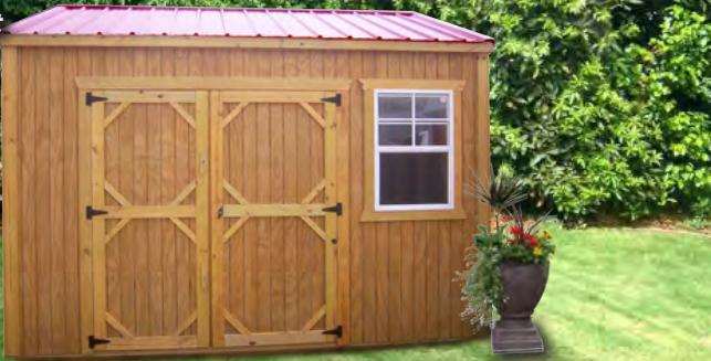
Standard Wall Height 7'3"

8' WIDE BUILDINGS COME WITH SINGLE 46" DOOR.