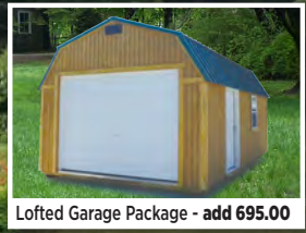
Lofted Garage Package - add 695.00