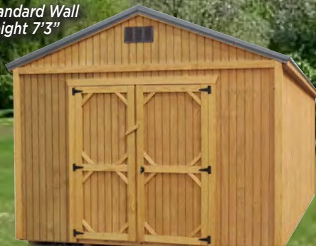
Standard Wall Height 7'3"