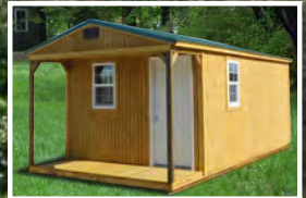
Add 595.00 for Cabin Package